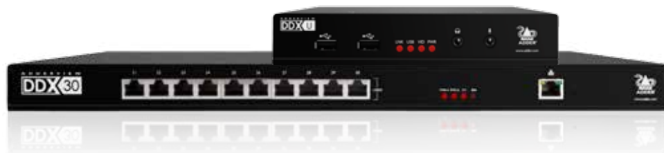
Pictured above: AdderView DDX30. Central KVM matrix switch AdderView DDX USR. User module (receiver)

For each additional break/patch connection reduce distance by 5 meters. Preferably patch cables should be of type CAT6 and less than 2 meters. Patch cables over 2 meters must be CAT6.