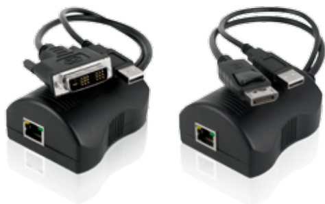
Pictured above: DDX-CAM-DVI (DVI Computer Access Module) DDX-CAM-DP (DP Computer Access Module)

System administrators can securely access the DDX30 management tools to configure system settings, set access privileges and control video connections. The interface is secured using HTTPS & administrators must login each time they connect. An API enables switch control from a 3rd party control system.